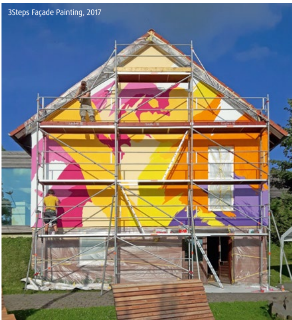
3Steps Façade Painting, 2017

Experiencing art and seeing how it is created, as well as conversations with artists – all this is part of Kunststation Kleinsassen. On a regular basis, artists are invited not only to exhibit here but to work here as well. This allows art lovers and artists to meet, exchange ideas, and inspire one another.