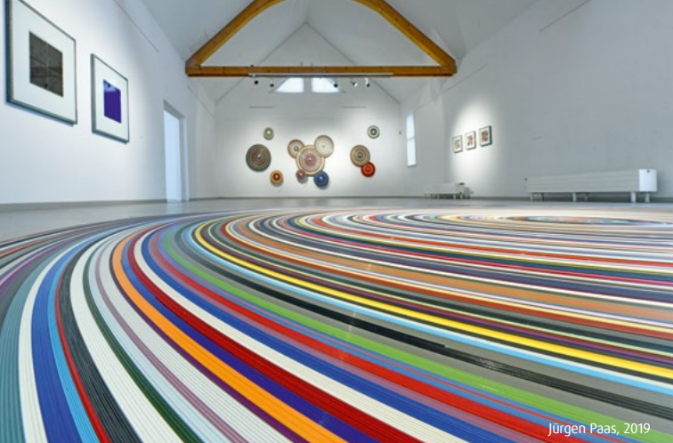
Jürgen Paas, 2019

Visitors have been enjoying art from around the world at Kunststation Kleinsassen for more than four decades. The brilliant experiment of presenting contemporary art exhibitions in the countryside, far away from the major cities, began in 1979. Today, Kunststation Kleinsassen has approximately 1,200 square metres of exhibition space, consisting of three large rooms and a studio for smaller projects. The exhibits in the main rooms change every three months; those in the studio, after six weeks. The selection of solo and group shows, of thematic or competitive exhibitions, could not be more varied. Open to all art genres and styles, the exhibition programme offers both up-and-coming as well as established artists from across the world a forum and does not shy from broaching socio-critical issues. Innovative or rarely shown positions in art are found here, as are unusual materials and work methods.